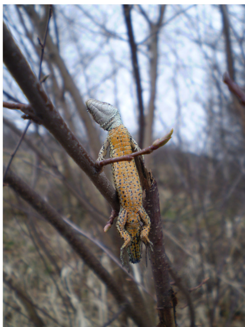
Fig. 1 Fresh impaled adult common lizards, L. vivipara

GLM main effect ANOVA showed the following results (intercept: SS = 51.83 , df = 1 , MS = 51.83 , F = 8.65 , P = 0.005 ; Table 1). Male-biased predation was not affected by territory or year of study ( SS = 119.43 , df = 25 , MS = 4.77 , F = 0.64 , P = 0.83 ; SS = 8.10 , df = 2 , MS = 4.05 , F = 0.55 , P = 0.58 ; respectively). Thus, the higher predation risk experienced by males of the common lizard was not influenced by the hunting of individual shrikes. However, there was a significant difference between the number of males and females among impaled individuals ( SS = 41.72 , df = 1 , MS = 41.72 ,